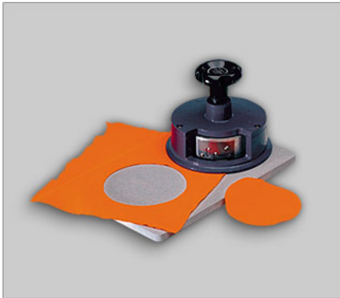
Sample cutter 240/100

Circular cutter for material thickness max. 3 mm